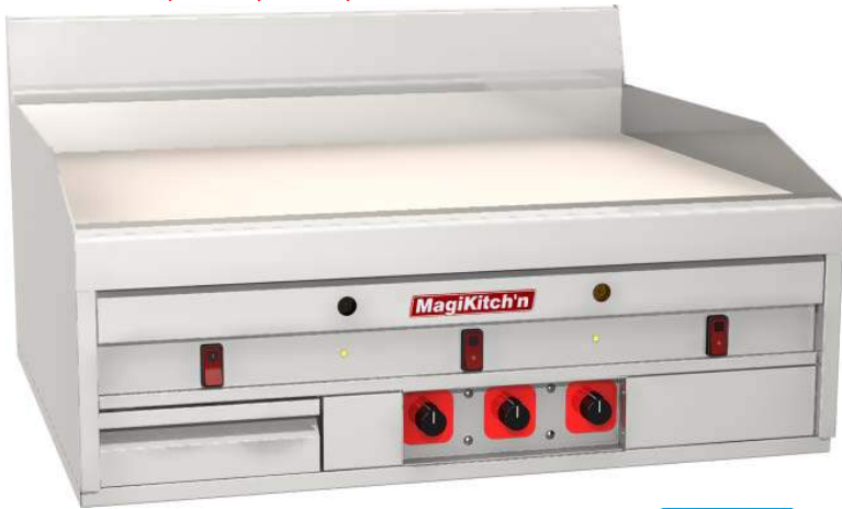
**MKH36 Solid State Controls Shown