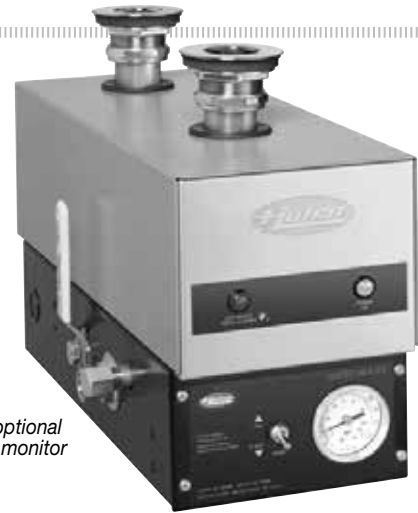
3CS-9 with optional temperature monitor