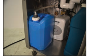
5 Gallon Container for Water Supply Shown for 26C Unit