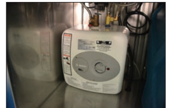
Water Heater Shown for 26CH Unit