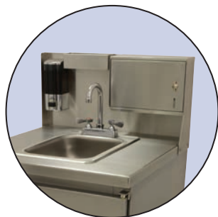
OPTIONAL TA-MSC-1 Shown

Conforms To NSF 61/9 Lead Free Requirements