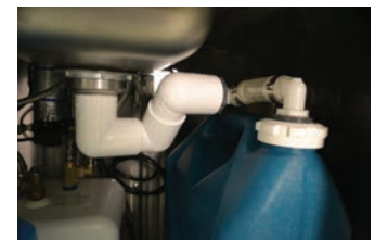
5 Gallon Container for Waste Water Shown for 26C Unit