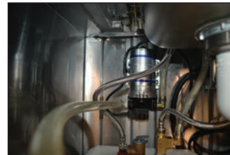
Water Pump Shown for 26C Unit